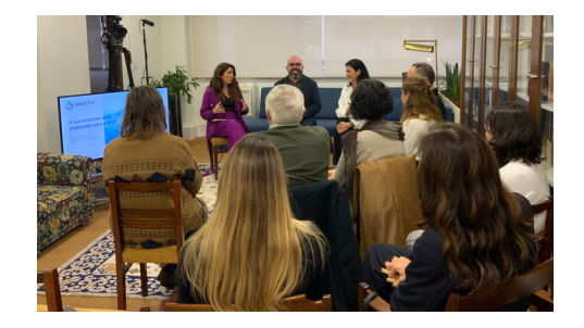
S SHOE 5.0 Is your company ready for Industry 6.0? Rey competences for the successful implementation of 15.0 objectives in the footward industry 5.0? Shoe $1.0 cities of the successful implementation of 15.0 objectives in the footward industry 5.0? WWW Ancids 8.0

In the case of Spain, participants had a very favourable impression of the Architect 5.0 profile, due to the innovative and advanced approach it represented. In Italy, participants stressed the need to include the development of digital skills, the circular economy and sustainability in all profile training paths.